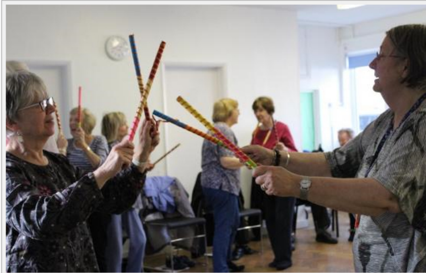
Dance Well at Harefield Library

Older adults living with chronic health conditions are improving their physical and mental wellbeing through the joy of South Asian dance, writes Claire Farmer .